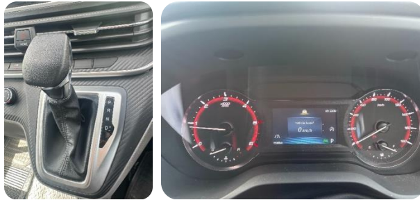
Gear stick in parking mode

Gear stick must be in PARK and your foot on the pedal in order for the vehicle to start.