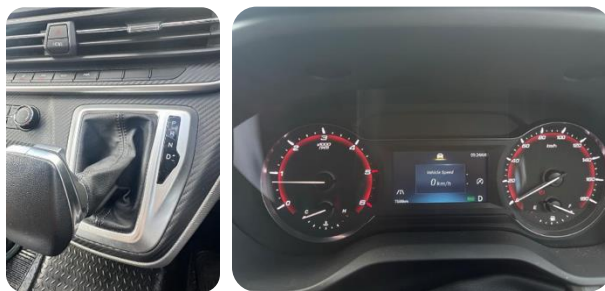
Gear stick in driving mode

The dashboard will display a 'P' indicating that the vehicle is in park. Start the vehicle using the ignition key.